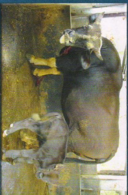
The first mithun calf born through AI

Progressive motility of mithun spermatozoa in fresh semen, in diluted semen after cooling (5°C for 4 h) and thawing and in preserved (LN 2 ) semen after thawing. a-b on error bar indicates a significant difference ( P < 0.01 )