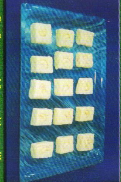
Barfi prepared from mithun milk

(Indian Council of Agricultural Research) Jharnapani, Medziphema, Nagaland - 797 106 www.nrcmithun.res.in