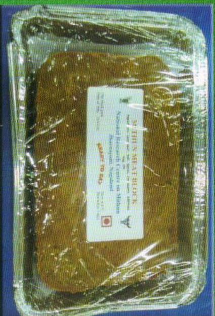
Ready to eat mithun meat block