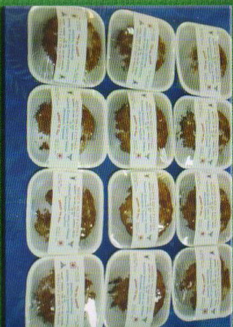
Ready to eat mithun meat patties