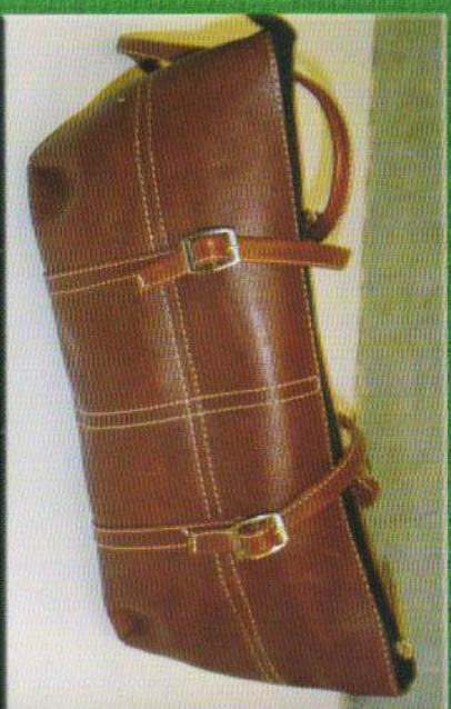
Bag prepared from mithun leather